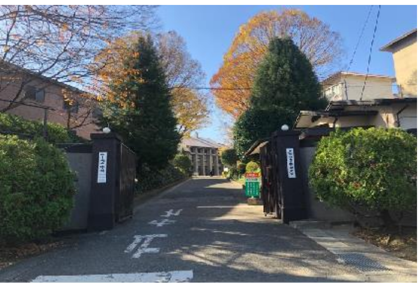
The entrance of Kyushu Lutheran School

Kyushu Lutheran School, established in 1926 in Kumamoto, has decided to open the international school primary school division in cooperation with AOBA International School Group in Tokyo.